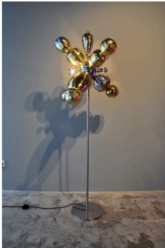
Floor lamp: Orion, 2016 Dimensions: 70 x 70 x 160 cm Materials: metal