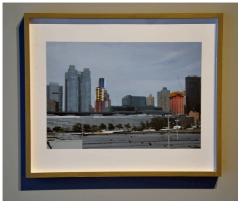
Collage: Parodie der Nichtexistenz, 2017 Dimensions: 50 x 30 x 5 cm Materials: wood / paper

Patrick Rampelotto used for his lamp a glass with a classical Art Déco ground finish from the archive of J.&L. Lobmey.