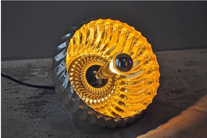
Floor lamp „Orakel“, 30 x 30 x 20 cm, metal, 2015

The trophy lamps of Patrick Rampelotto are at the core of his cultural piracy practice. Every lamp consists in a unique cluster of metal and plastic pieces, either purchased in flea markets or from private collections. As the trophies are dismantled and then reassembled, they become evermore abstracted from their original purpose. They are taken to another level as they become unrecognizable. The trophy lamps, just like trophies themselves, symbolize an outstanding achievement. But they bear a new signature: the inimitable formal language invented by Rampelotto. Each lamp evokes a flamboyant explosion, as well as a creature of rough majesty. In their witty elegance, they show striking sculptural and symbolical qualities. All in all, his trophy lamps stand for the pure exuberance of form and will.