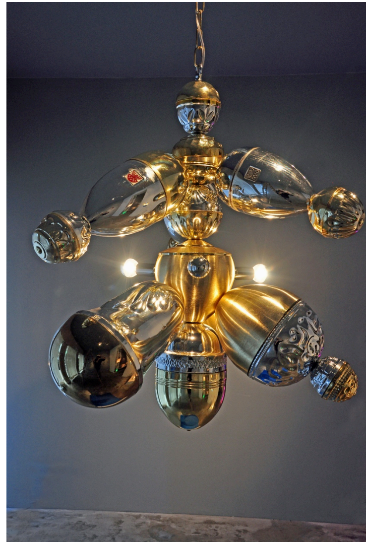
Chandelier „Plantasia II“, 2017 Dimensions 70 x 70 x 90 cm Materials: metal, 2017

The trophy lamps of Patrick Rampelotto are at the core of his cultural piracy practice. Every lamp consists in a unique cluster of metal and plastic pieces, either purchased in flea markets or from private collections. As the trophies are dismantled and then reassembled, they become evermore abstracted from their original purpose. They are taken to another level as they become unrecognizable. The trophy lamps, just like trophies themselves, symbolize an outstanding achievement. But they bear a new signature: the inimitable formal language invented by Rampelotto. Each lamp evokes a flamboyant explosion, as well as a creature of rough majesty. In their witty elegance, they show striking sculptural and symbolical qualities. All in all, his trophy lamps stand for the pure exuberance of form and will.