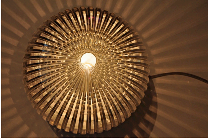
Lamp „Deda“, 45 x 45 x 45 cm, crystal glass / aluminum, 2017

Patrick Rampelotto used for his lamp a glass with a classical Art Déco ground finish from the archive of J.&L. Lobmey.