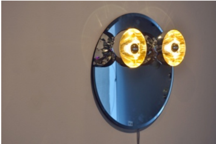
Mirror: „J“, 50 x 50 x 15 cm, glass / metal, 2017