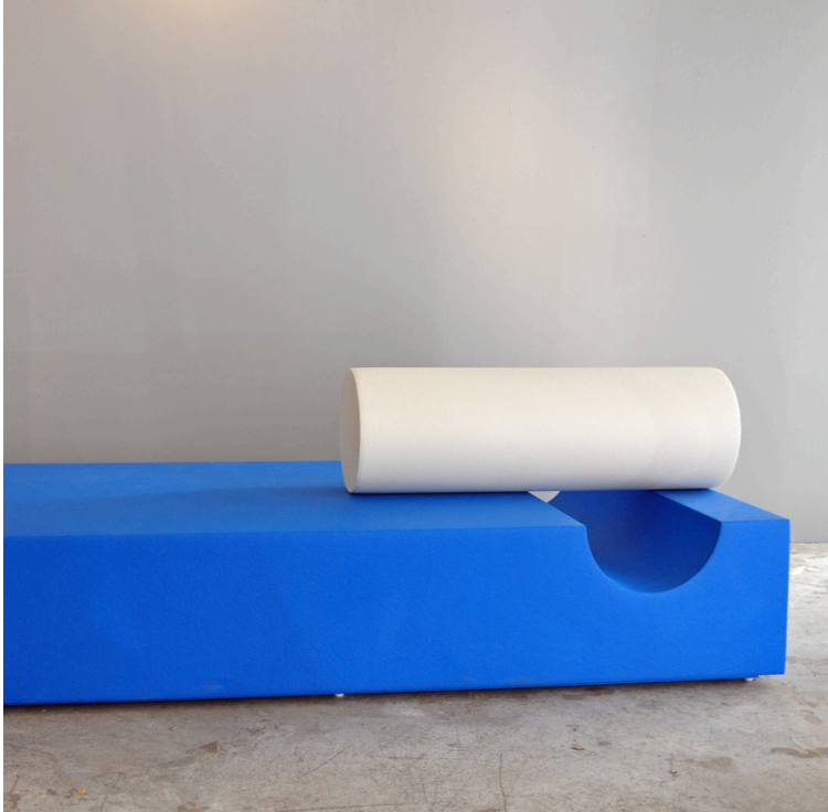
Daybed, 2017 Dimensions: 200 x 80 x 40 cm Materials: Q&M foam (Detail)