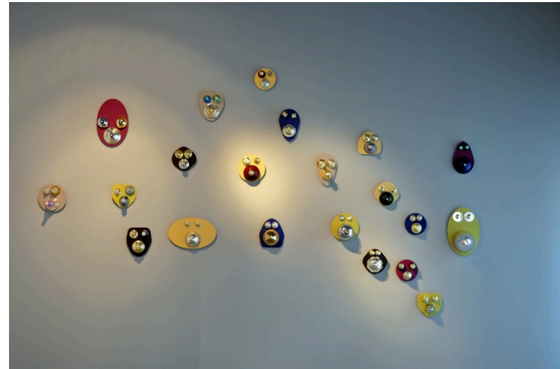
Exhibition view „PATRICK RAMPELOTTO – V A P O R W A R E“, 2017