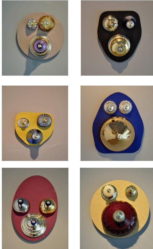
Masks „Amigos“ (numbered Edition of 21 pieces), plastic / metal, 2016