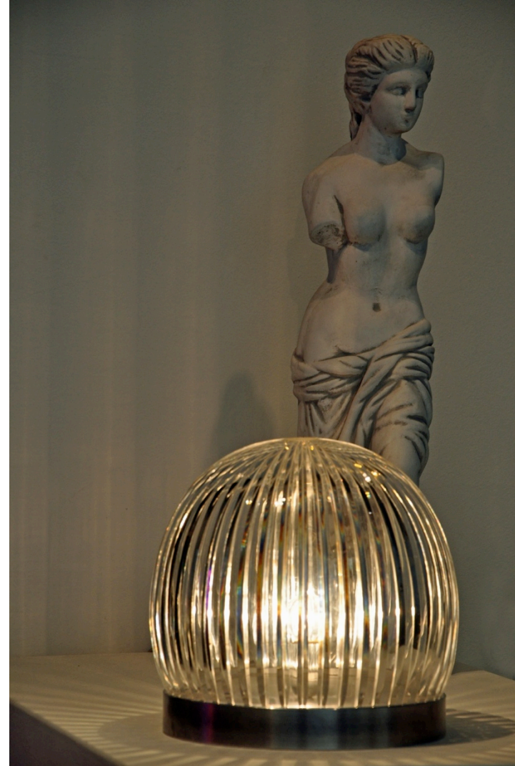
Lamp „Deda“, 2017 Exhibition view „PATRICK RAMPELOTTO – V A P O R W A R E“, 2017